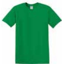
Antique Irish Green