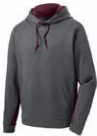
Grey / Maroon