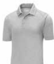
Heather Lt Grey