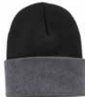
Black / Oxford