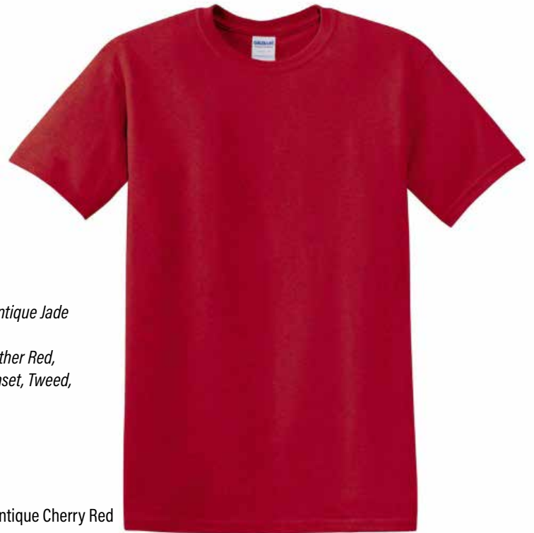
Antique Cherry Red

Gildan® - Heavy Cotton™ 100% Cotton T-Shirt. 5000