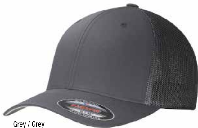
Grey / Grey