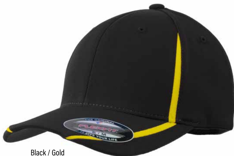
Black / Gold