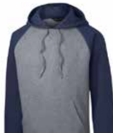
Grey / Navy