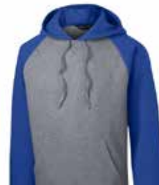
Grey / Royal