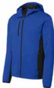
Royal / Black

Open hem with adjustable locking drawcord