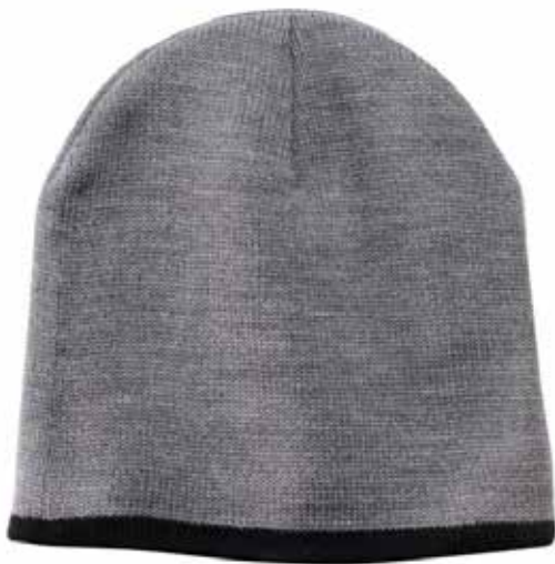
Oxford / Black