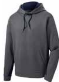
Grey / Navy