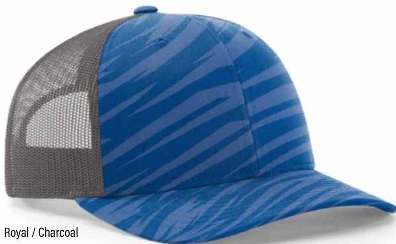
Royal / Charcoal