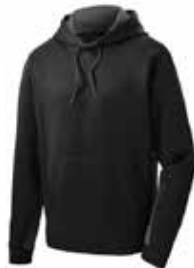
Black / Grey