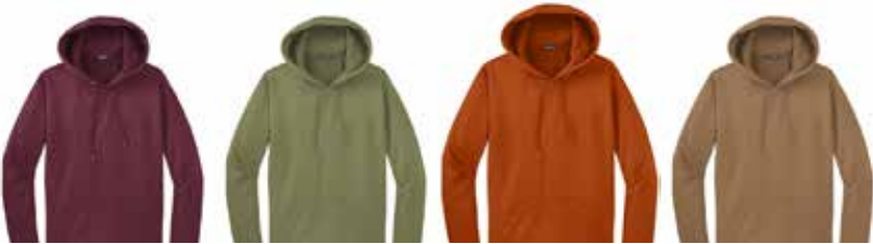
Maroon Olive Drab Texas Orange Woodland