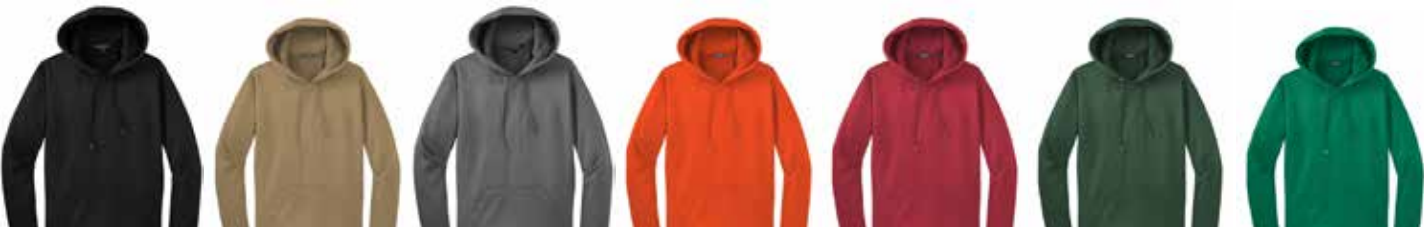
Black Coyote Brown Smoke Grey Orange Red Green Kelly Green