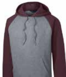
Grey / Maroon