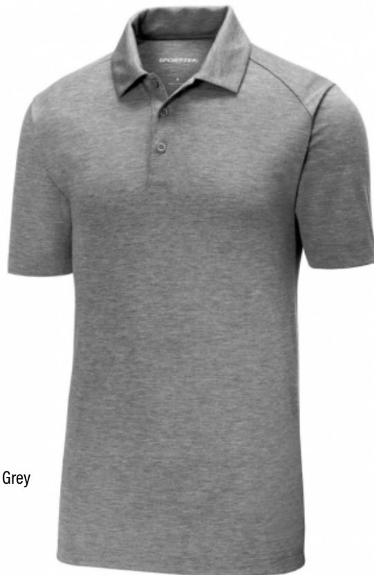
Heather Dk Grey

Sport-Tek® PosiCharge® Tri-Blend Wicking Polo. ST405 This ultracomfortable polo combines moisture-wicking performance, unbeatable tri-blend softness and PosiCharge technology to lock in color.