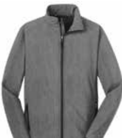
Pearl Grey Heather