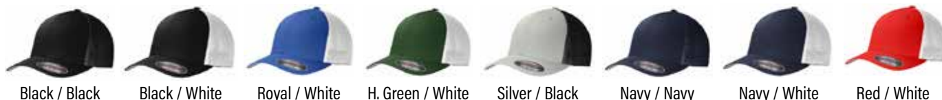
Black / Black