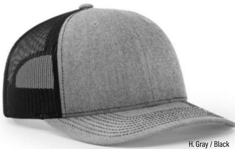
H. Gray / Black