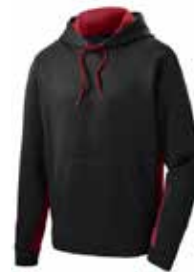
Black / Red