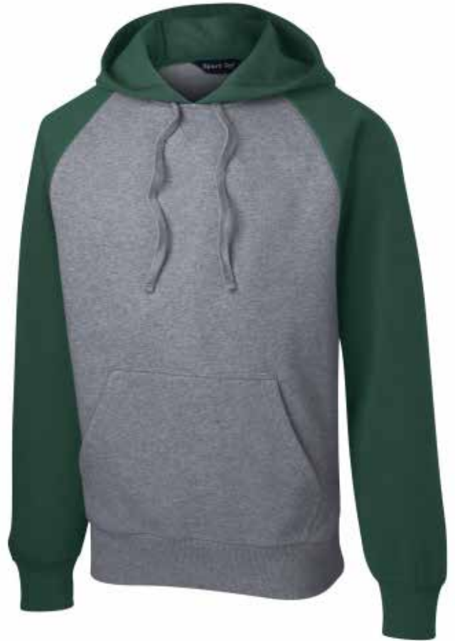
Grey / Green