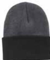
Oxford / Black