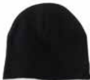
Black / White