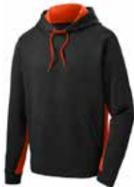
Black / Orange