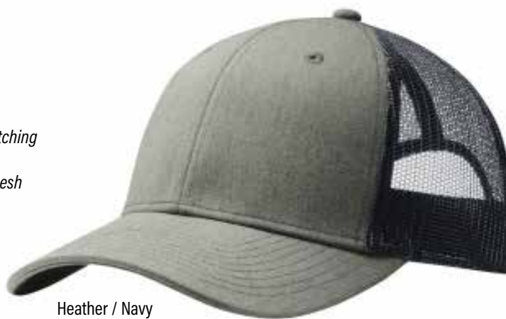
Heather / Navy