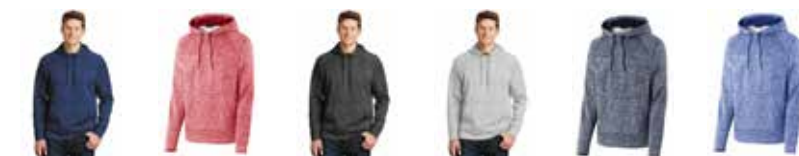
Electric Dk Royal