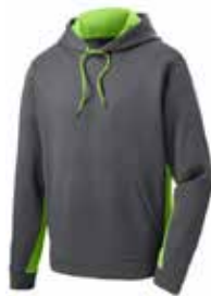
Grey / Lime