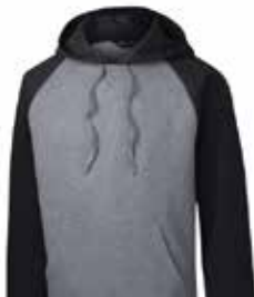
Grey / Black