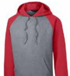
Grey / Red