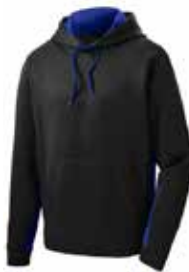
Black / Royal